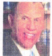
At Ottawa University, 2002